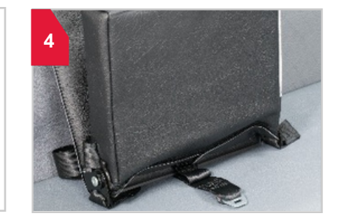
Locate belt that comes out of bottom of PCR cushion.