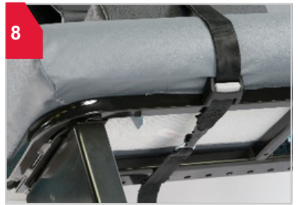
Hook belt from step 4 to snap clip on belt from step 7. Adjust to create a snug fit.