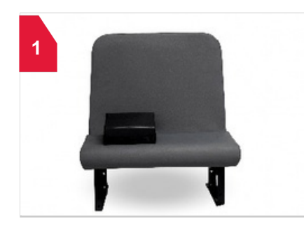
Place PCR on seat as shown.