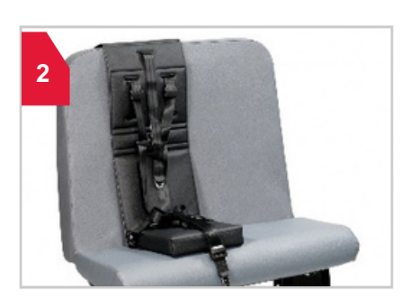
Unfold PCR and place on seat as shown.