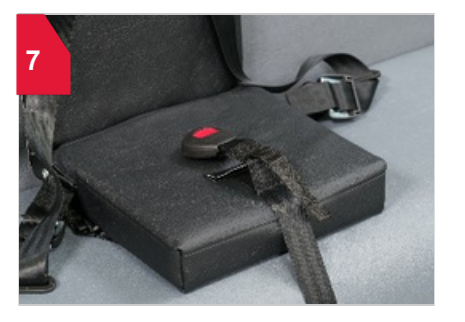
Pull belt located at front of PCR cushion around front of school bus seat cushion and let belt hang.