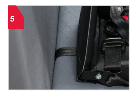
Push belt from step 4 through bight of school bus seat. Make sure belt is flat and not twisted.