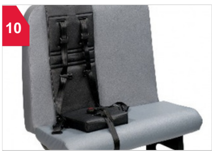
Unfasten seatbuckles before placing child in PCR as shown.