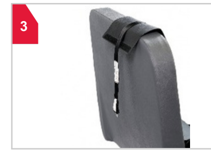
Drape PCR top belt over school bus seat back and let belt hang down.