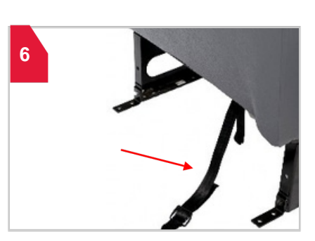
Pull belt and PCR to back of school bus seat. Belt should look as shown when finished.